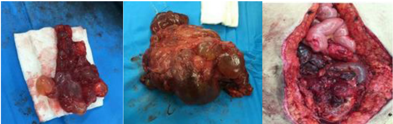
Figure 2. Pictures display tumor mass before and after surgical resection