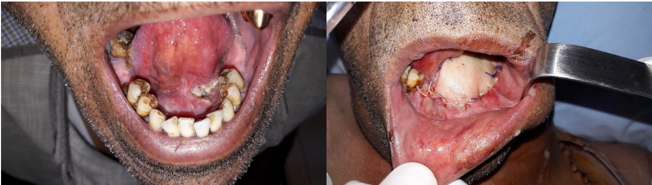
Figure 4. Patient with T3N1M0 SCC of the floor of mouth after resection of the primary tumor with marginal mandibulectomy and reconstruction using PMMF.

neous flaps and Ariyan 1,2,11 also suffered 2 losses in 5 cases in which the rib was used. An additional advantage of PMMF is the muscular cover provided by the pedicle to the bare carotid vessels following neck dissection, thus greatly diminishing the incidence of carotid blow-out 2 .